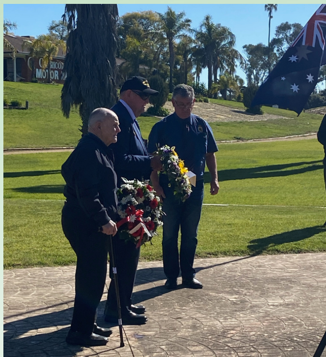
Above: Wreath laying on Victory in the Pacific Day 15 August 2023 at the Club Mulwala Memorial Wall